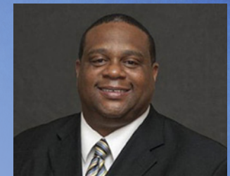
24th Legislative District Allegheny County